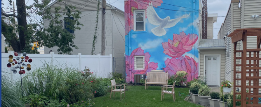
Healing Garden created to stay operational during COVID-19 Pandemic